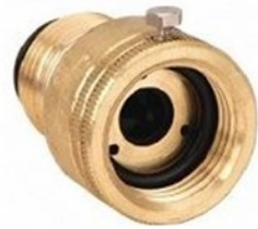
Hose Bibb Vacuum Breaker (HBVB)

http://water.epa.gov/nfrastructure/drinkingwater/pws/crossconnectioncontrol/index.cfm